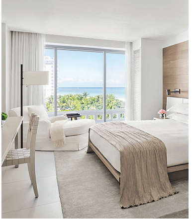
The guest rooms are swathed in soothing neutrals and many have sublime Atlantic Ocean views.

lime, chipotle, aioli, avocado and jalapeno.