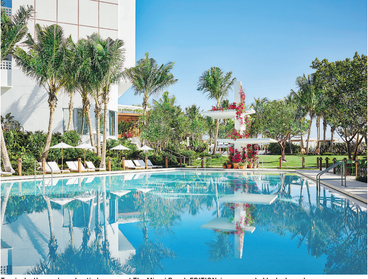
Tropicale, the pools and patio bar area at The Miami Beach EDITION, is surrounded by lush gardens.

All of the guest rooms are delicious and even the smallest are inviting. Sliding doors open the bathroom walls for more space, which can be closed for privacy. If you can splurge, the Beachhouse suites are movie-star level - palatial, luxurious apartments with a relaxed residential feel and wraparound verandas overlooking the ocean. The guest bathrooms are ultra-sleek, with high-design sinks, tubs, double rain-showers and toiletries